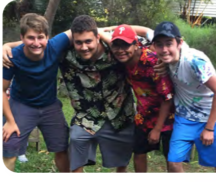
For more information, visit camp-sequoia.com/hawaii